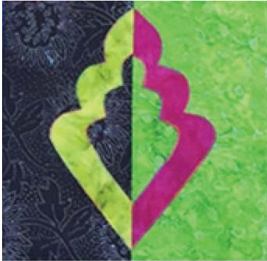
BLOCK 3: THE LEAF Finished Size: 10" x 10"

This is designed for raw edge appliqué. If you wish to convert to needleturn, add 1/4" seam allowances,