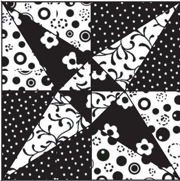
Crossed Canoes - 12"

PLEASE NOTE: This fabric stash block first appeared in the December/January 2007 issue of QUILT magazine. Many fabrics have a shelf life of about 6 months to 1 year. These exact fabrics may not still be available for purchase. Take heart! Your favorite quilt shop can help you select suitable substitutes in colors and patterns that will work just as well to make this block.