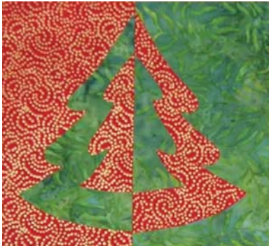
BLOCK 3: THE TREE Finished Size: 10" x 10"

This is designed for raw edge appliqué. If you wish to convert to needleturn, add 1/4" seam allowances,