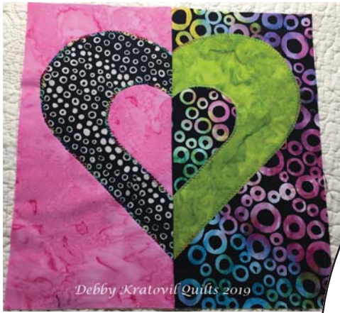
BLOCK 1: THE HEART Finished Size: 10" x 10"

This is designed for raw edge appliqué. If you wish to convert to needleturn, add 1/4" seam allowances,