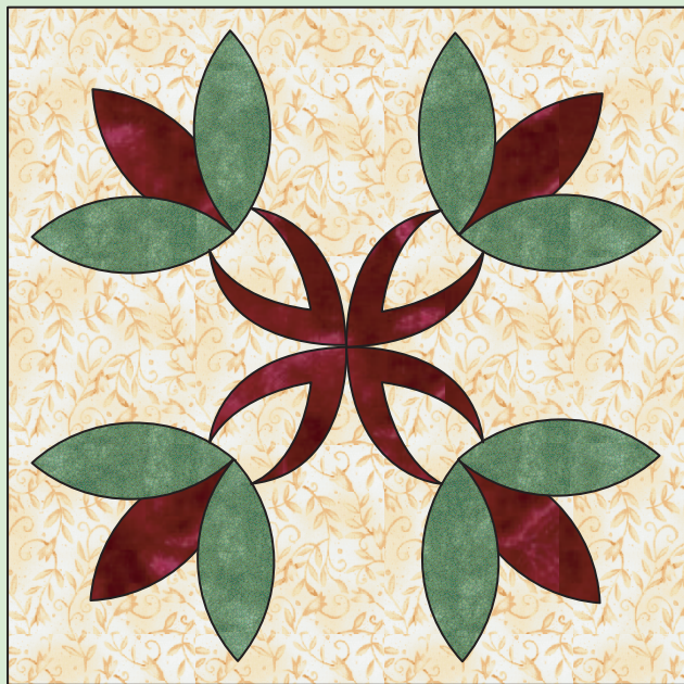
Wandering Foot 10"