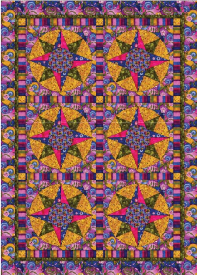
Quilt Size: 50" x 68"