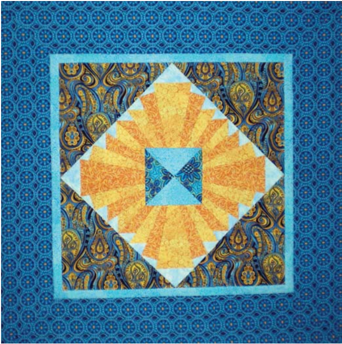
Casablanca Sunrise© 14" Block (four 7" units, foundation pieced) Quilt Size as shown: 31" x 31"